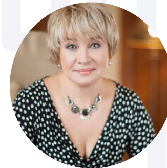
Head of the Center

CFC publishes quarterly e-Journal of Corporate Finance Research