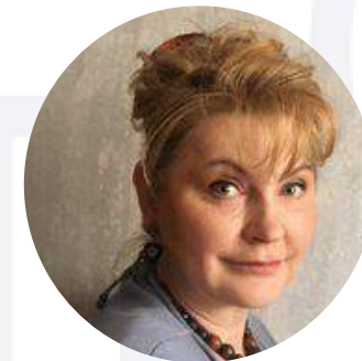
Head of the Laboratory

The Centre is designed to provide HSE teaching staff and students with a qualitative incentive for joint research projects in the analysis of evolution and performance issues of financial integrated and segmented markets as well as for investigation into motivation, behavior, and strategy investors and regulators.