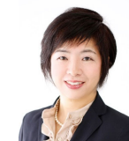
Collegio Del Mondo Unito Dell'Adriatico